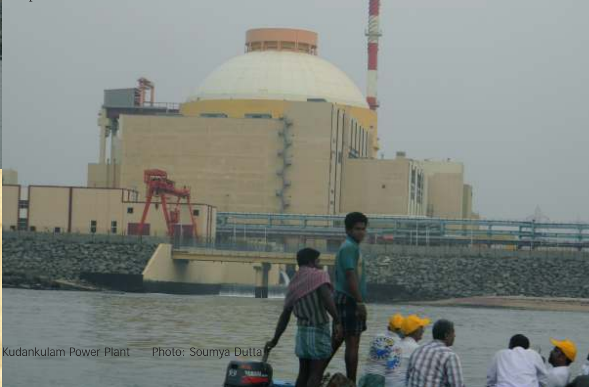
Kudankulam Power Plant

Finally, there has been significant opposition to every new nuclear reactor and uranium mining project that has been planned since the 1980s, most dramatically illustrated by the intense protests over the Koodankulam reactors (Kaur 2012). In addition to concerns about safety or radioactive waste, opposition to nuclear facilities also stems from their impact on lives and livelihoods. This source of opposition will likely intensify over the decades as land and other natural resources become subject to tremendous competition.