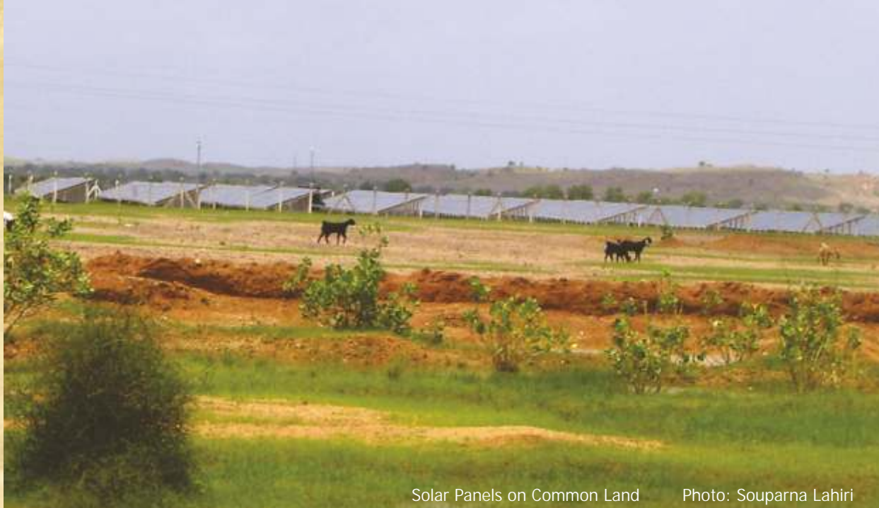
Solar Panels on Common Land

Wind turbines create another kind of problem, though actual land requirement is very small (many operators have actually taken far larger land – probably with future commercial interests, leading to land conflict with villagers). The low-frequency infra-sound is disturbing when other sounds die down in the