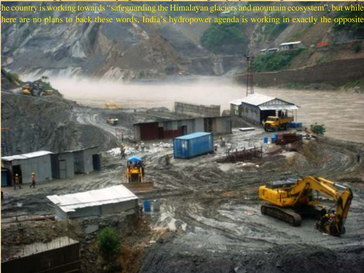
Destruction by Large Hydro, Subansiri dam

This is apparent in the way the government is pushing large hydropower projects all across the Himalayas from Kashmir in north-west to Arunachal Pradesh and rest of North East India, large dams and river linking plans, without either properly assessing the impacts of the projects, or having a democratic decision-making process, or in any significant way involving the people of the region. India's INDC says the country is working towards "safeguarding the Himalayan glaciers and mountain ecosystem", but while there are no plans to back these words, India's hydropower agenda is working in exactly the opposite