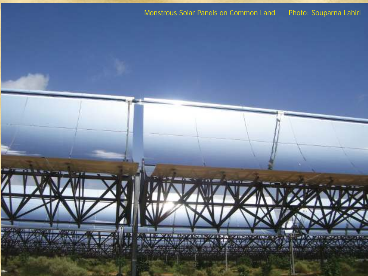
Monstrous Solar Panels on Common Land