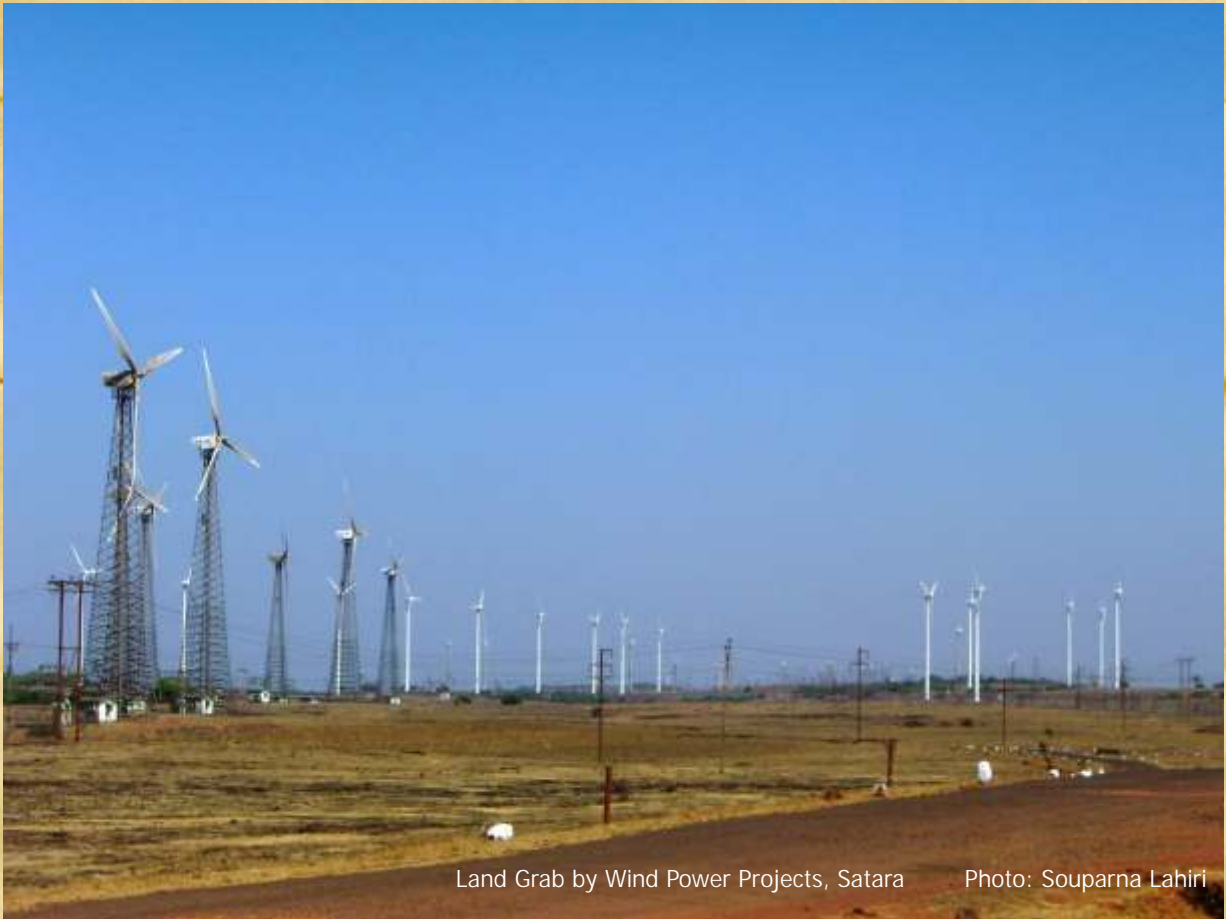
Land Grab by Wind Power Projects, Satara