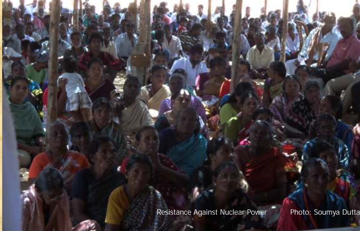
Resistance Against Nuclear Power