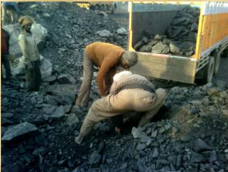
Open Cast Coal Mine

India’s INDC claims that coal is necessary for uplifting “the largest proportion of global poor (30%), around 24% of the global population without access to electricity (304 million), about 30% of the global population relying on solid biomass for cooking and 92 million without access to safe drinking water”. The reality is that from 1991 to 2011, India increased its centralised installed power capacity by three times (from around 63,000 MW to 187,000 MW), while merely reducing the number of unserved/ unconnected