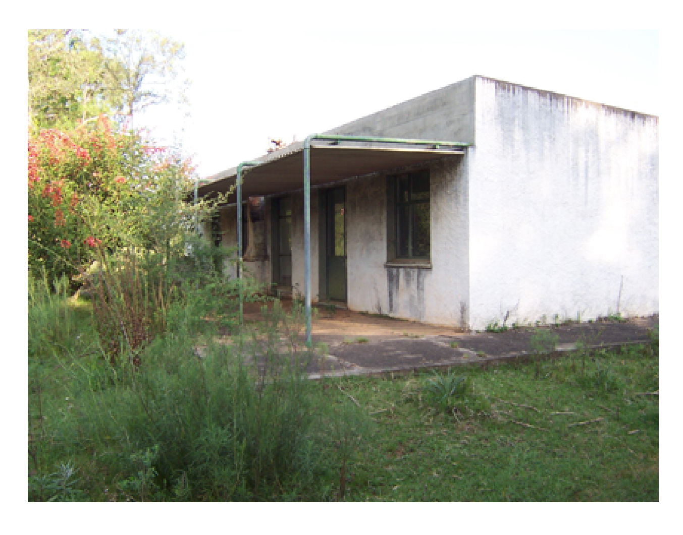
Abandoned school building near Tranqueras, in Rivera