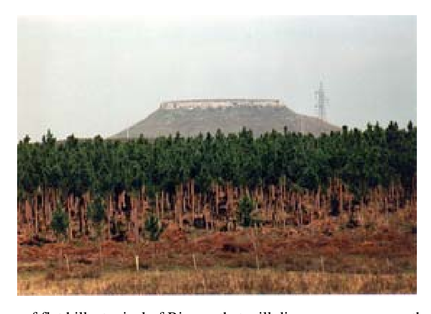
Landscape of flat hills, typical of Rivera, that will disappear as soon as the pines grow