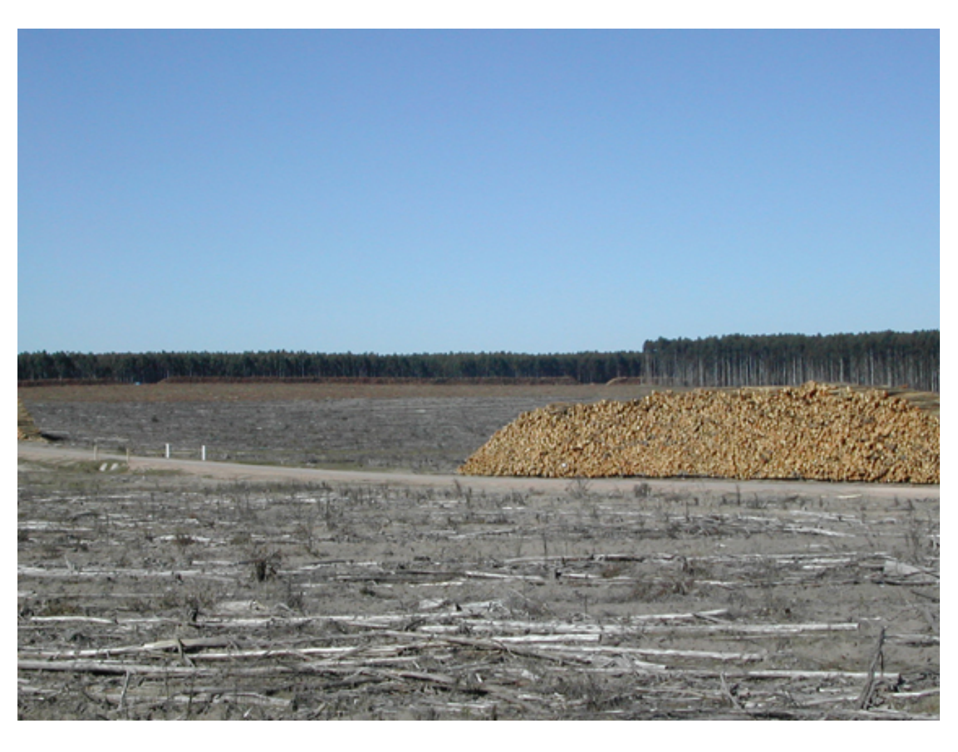
Soil without vegetation, after the harvesting of eucalyptus