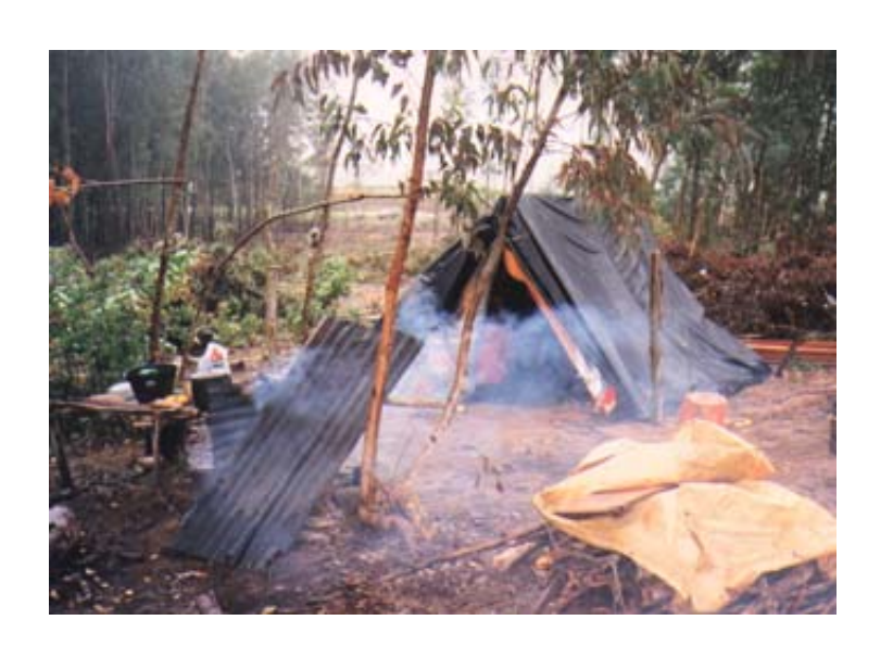
Working conditions. Kitchen / Dormitory