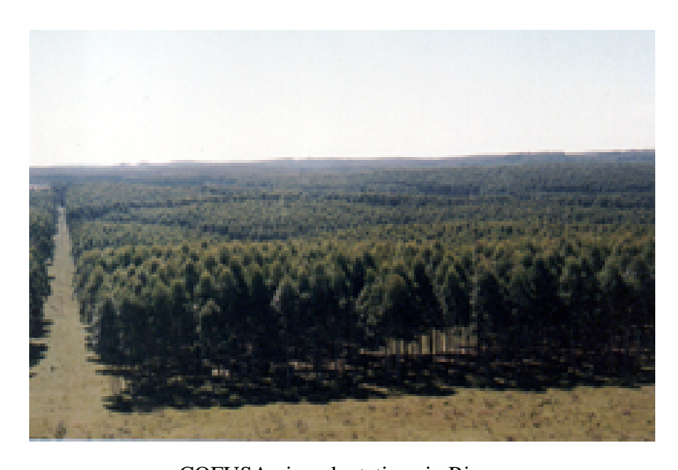
COFUSA pine plantations in Rivera