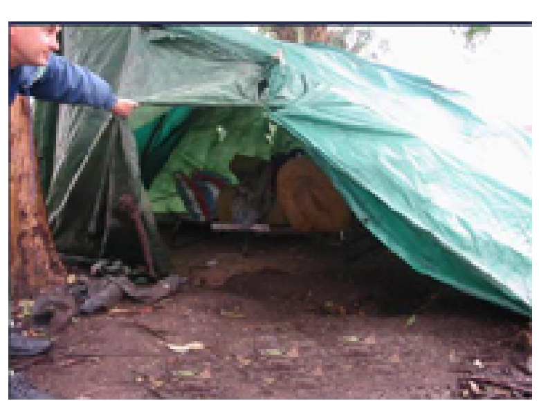
Working conditions. Dormitory