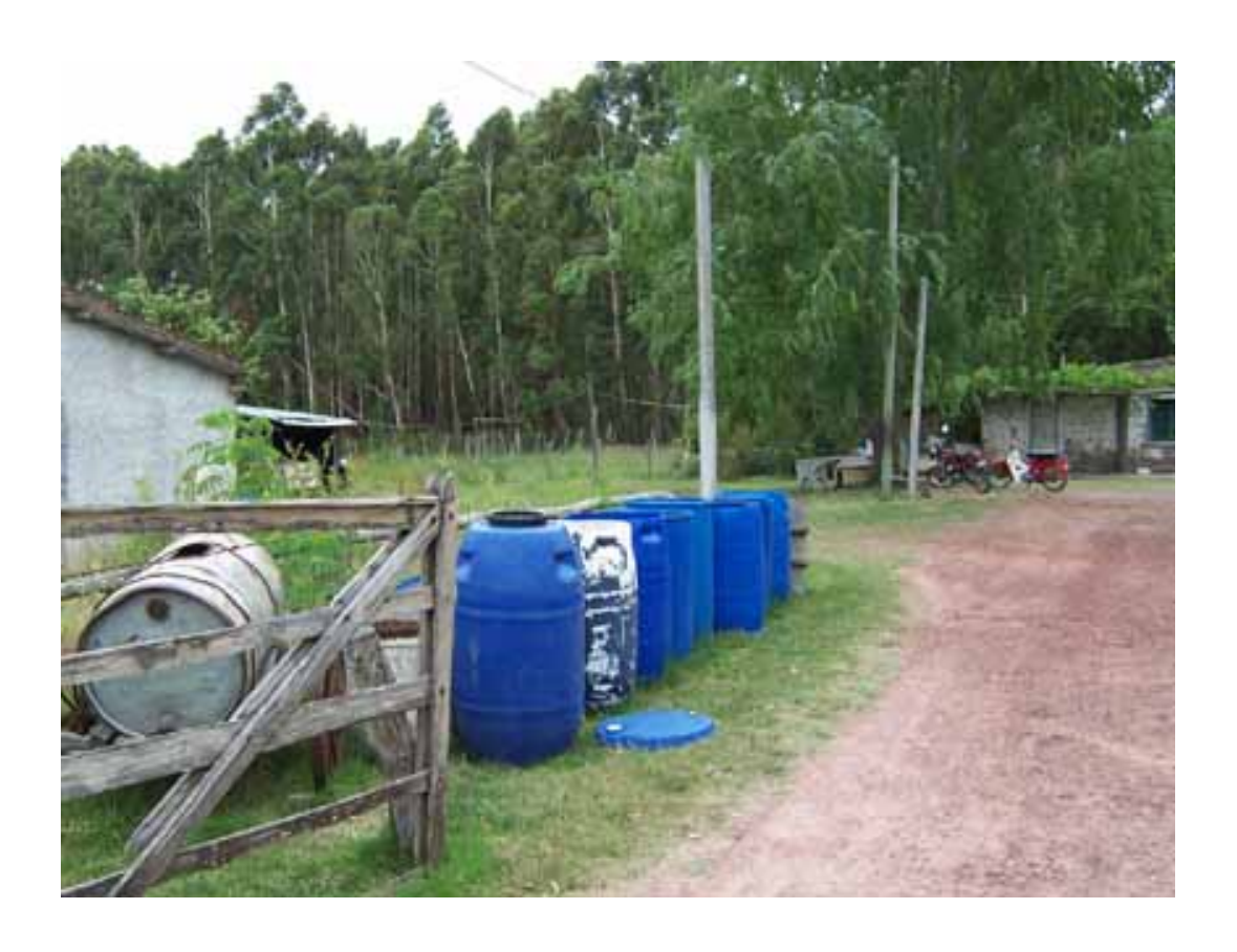
Paraje Pence in Soriano. At the back, eucalyptus plantations that caused the depletion of water. In front, containers for the water brought in cistern trucks