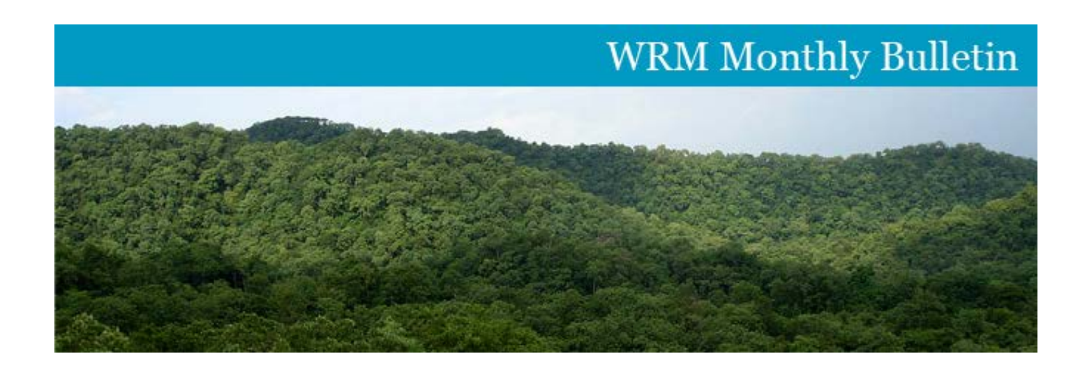
Bulletin Issue Nº 208 – November 2014