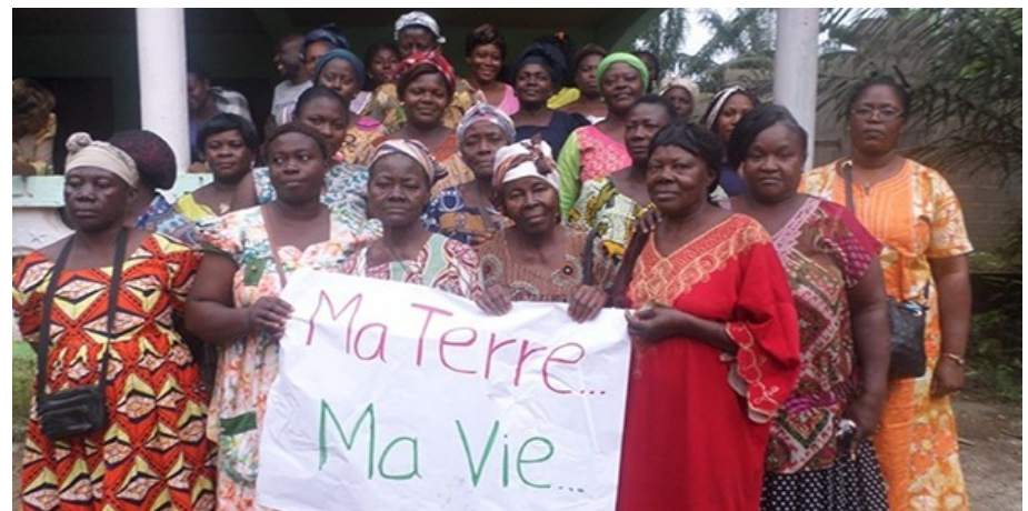
"My land, my life". Camaroon. Ph: RADD, 2017.

By the end of 2000, the fever for agricultural lands in Africa for large monoculture operations had accelerated. Today, this fever increases with emerging policies that consider these initiatives to be great development projects that create jobs and added value. For the most part, these projects are well received by national and local decision makers in the areas where they are implemented. It is absolutely necessary to put on the activist hat to demonstrate and establish the need to protect those who are excluded from this system.