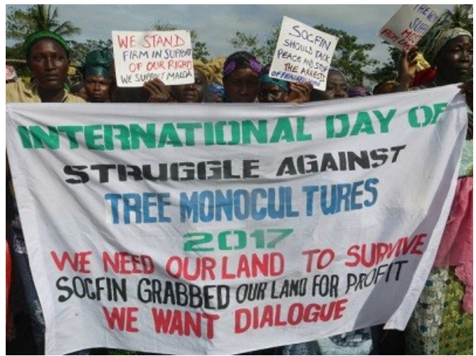
Women in Sierra Leone. 2017.

On International Women's Day , this bulletin seeks to shine a light on and denounce many of the realities that are generally hidden behind the termed "differentiated impacts" on women who live in and around monoculture plantations.