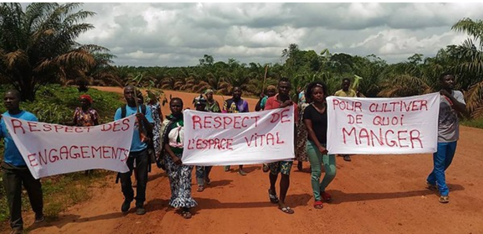
"Respect des engagements. Respect de l'espace vital. Pour cultiver de quoi manger". Cameroon. Ph: Synaparcam, 2017.

The SOCAPALM company, part of the multinational agri-food group SOCFIN (1), has been hiring security guards for its palm oil plantations in Dibombari in south-west Cameroon to prevent local people from harvesting palm nuts. Security companies initially were tasked with policing the plantations. However, the local population has increasingly witnessed the presence of soldiers, whose interventions have been compared to those observed in war zones.