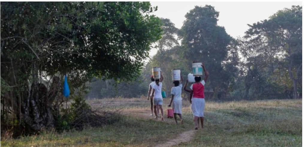
Women in Maríalabaja, Colombia.

Oil palm plantations destroy not only the biodiversity of tropical forests, but also peoples and villages who have lived in traditional economies until the arrival of this agribusiness. In many cases, it is women who most vigorously defend their territories.