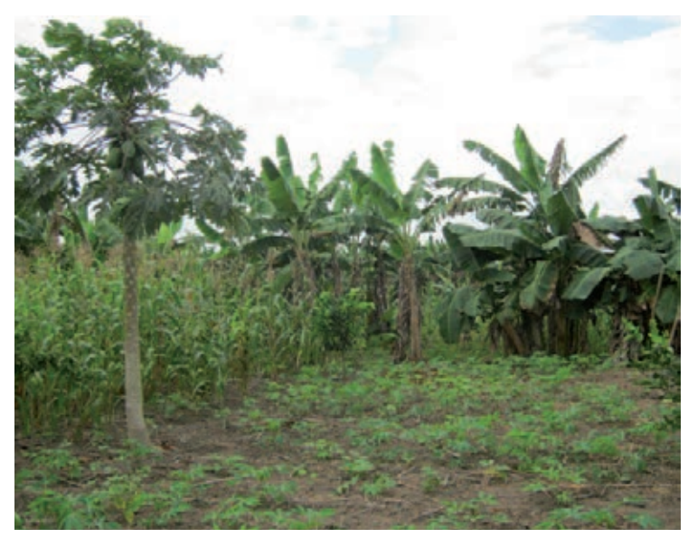
Community vegetable garden. Community of Nueva Vida, Rigores, Honduras.

Furthermore, in situations where people hand over their lands or a portion of their lands to expanding oil palm companies and receive compensation that they themselves consider adequate, the risk to food insecurity in the future remains. Continued access to their land would have enabled them to continue to grow food they now cannot grow anymore. The result is a loss of or increased risk to their food sovereignty, today and in future, and also of the region that the farmers supply with the food crops they previously grew. Taking farmland away from people can therefore mean putting people at risk of hunger if no job or work alternatives are available, irrespective of whether or not adequate compensation was paid initially which as mentioned under reply to lie 2 above, most often is not the case.