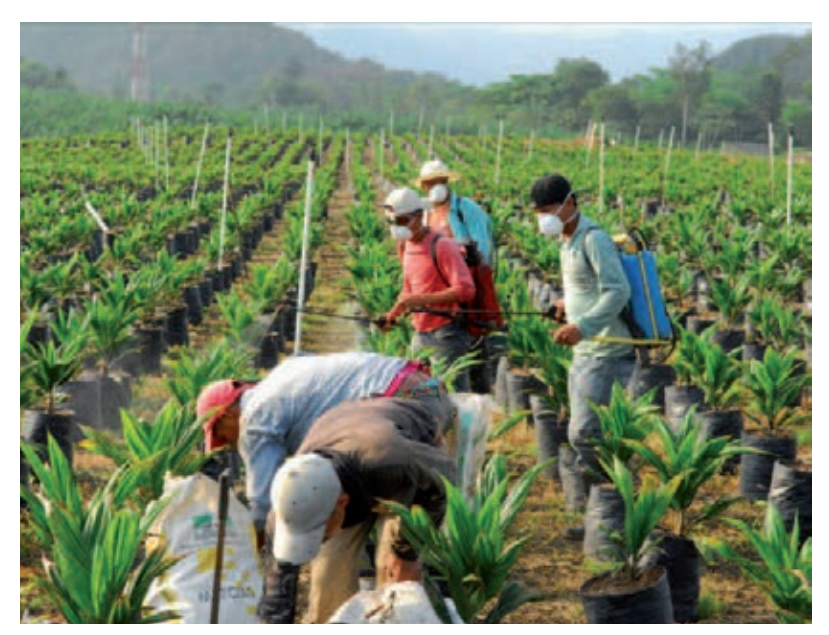
Farmworkers spray pesticides on young palm trees, department of Alta Verapaz, Guatemala.

Any large-scale monoculture depends on agrotoxins and fertilizers, in order to guarantee the high production that the companies pursue. Even the so-called "minimal" 4 quantities used cause significant impact for local inhabitants. The agrotoxins, and even fertilizers used in the plantations pollute water on which people depend. A further source of pollution are the mills where oil palm fruit is processed to obtain the crude palm oil. Rivers and streams that people use to obtain drinking water, for bathing and washing clothes become polluted with this so-called Palm Oil Mill Effluent (POME). When the plantations expand, this pollution increases along with the volume of oil palm fruit processed in the mills, often to the point where the water is not useable anymore.