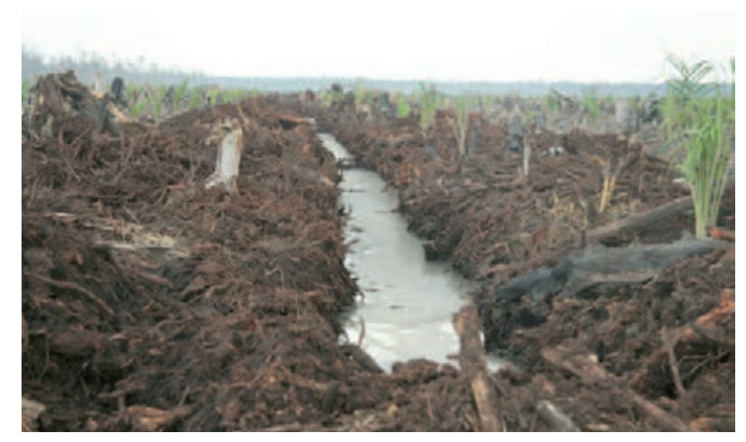
Deforested area with recently planted oil palm trees in South Sumatra, Indonesia.

Governments of oil palm producing countries and palm oil producing companies lobby at the international level to have oil palm plantations considered as forests the United Nations organization FAO still defines them as an agricultural crop. By having them relabelled as "forests", the aim is to secure access to REDD+ 10, CDM 11 or other ecosystem trading schemes, which could then enable the companies to generate an extra income from selling carbon credits from the oil palm plantations. However, the idea of oil palm companies receiving money for (temporary!) carbon storage in their