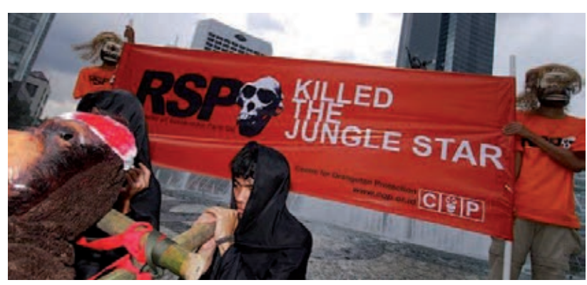
Protests on the occasion of the annual meeting of the RSPO, Jakarta, Indonesia.

The Roundtable for Sustainable Palm Oil (RSPO) has put together a set of principles and criteria which a company that wants to be certified by the RSPO needs to adhere to, to be able to claim to produce "sustainable palm oil". However, RSPO suffers from structural problems that make it impossible to deliver this promise. The main problem is that the big global players in the palm oil sector represent the huge majority of its members. Another problem is that RSPO does not differentiate between