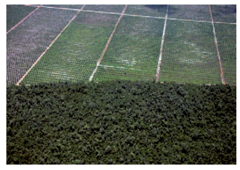
Oil palm plantations are a major cause of deforestation in Indonesia.

Oil palm companies tend to occupy the lands with the best growing conditions for their oil palm, rather than establish their plantations on "degraded lands and grasslands that have already lost their environmental and economic values as a result of intensive logging and other human activities which leave the land exposed to rain and wind erosion, thereby reducing soil productivity". Soil fertility and availability of water are key factors that determine where oil palm companies establish their plantations. Favoured lands include forests, causing large-scale forest destruction and destroying ecosystems that are fundamental in many ways for the physical and cultural well-being of the local forest-dependent populations.