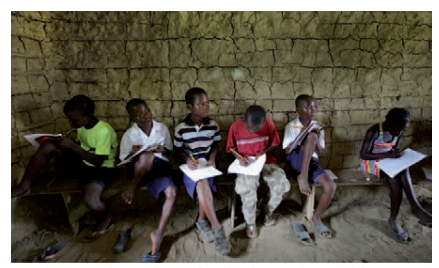
Students study in a "classroom" in Grand Bassa, Liberia, built by Equatorial Palm Oil.

At the end of the day, companies benefit more from government measures to 'attract investment' getting concessions for low or no fees and other advantages such as tax breaks, subsidies, loans with low interest rates, etc. - than communities benefitting from the company's local initiatives. In Gabon for example, an agreement between the government and oil palm producer Olam includes income tax holidays for 16 years, exemption from VAT and custom duties on imported machinery and inputs, Oil & Gas and fertilisers. <sup>21</sup>