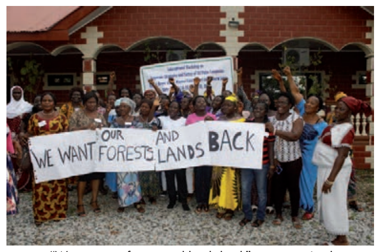
"We want our forests and lands back", say organized women in Sierra Leone (2017)

Violence against women not only occurs when they work for the companies; women also suffer violence in their daily lives around the plantations. Companies monopolize their land, and pollute, divert or dry up the rivers. As a result, women and girls are forced to walk much farther to find water and land suitable for food production. If on their way they must walk through plantations, they are exposed to harassment and violence by security guards or policemen. In the few cases where they dare to report what has happened, impunity usually reigns. This leads to their frustration, and it perpetuates the violence. They are forced to walk in groups in order to protect each other. These are situations in