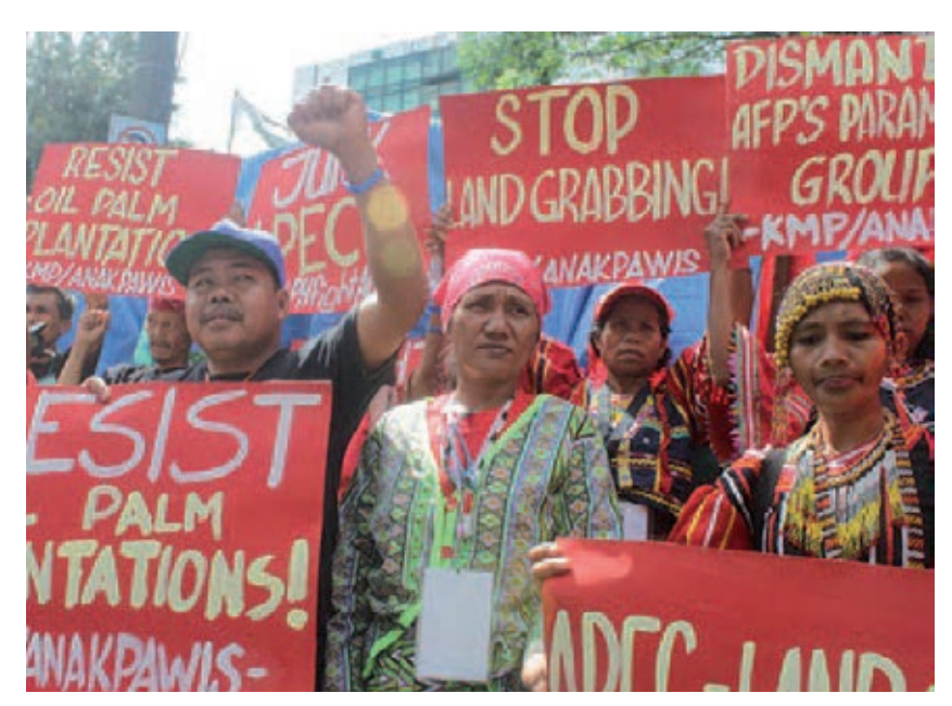
Farmers and indigenous peoples protest against plans to expand oil palm plantations, Phillipines.

So when companies are contacting communities, it is usual for them to come not to listen and learn about community demands and about how the land is already used. They come to inform the community about the company plans in the hope that communities will not hinder but rather support them. To obtain