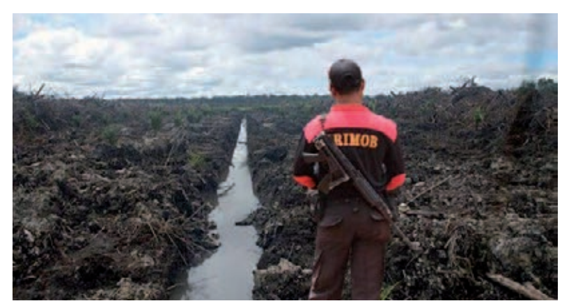
In Indonesia, oil palm companies hire armed thugs to protect their plantations.

In most cases, people who have lost access to land as a result of a large scale oil palm plantation do not receive any compensation at all. This has to do with the fact that in many countries in the global South people do not hold legal title to the lands they use and on which they have often lived for many generations. They do however hold customary rights to the land. When national governments establish rules for how to calculate such a "compensation", these rules often exclude lands under customary use. Companies claim they provide adequate or rightful