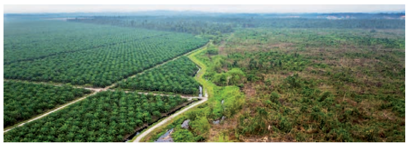
Oil palm plantation in the east of Miri, Borneo, Indonesia.

Stronger alliances among communities and organizations in consumer countries and oil palm plantation countries are needed to more effectively challenge the ongoing expansion of oil palm plantations. This will need to involve among others exposing the lies and empty promises of oil palm companies, solidarity with those defending the territories and forests on which communities in Asia, African and Latin American countries depend and that are at risk of being taken over by palm oil plantations. It will also require solidarity with those working towards different production and consumption models which are not based on further destruction of forests and peoples' livelihoods in the global South.