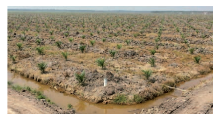
Oil Palm plantation in South Sumatra, Indonesia.

vegetable oil in general, including oil made from other seeds like soy and rapeseed. This is due to its excessive consumption pattern that includes the use of oil palm in a large range of different supermarket products, different from China's and India's use which is largely related to basic use for cooking purposes. Per capita vegetable oil consumption in the EU in 2010 was 2.6 times bigger than in China and 4.5 times bigger than in India <sup>23</sup>. EU agrofuel targets set in recent years are another driver of oil palm consumption in the EU.