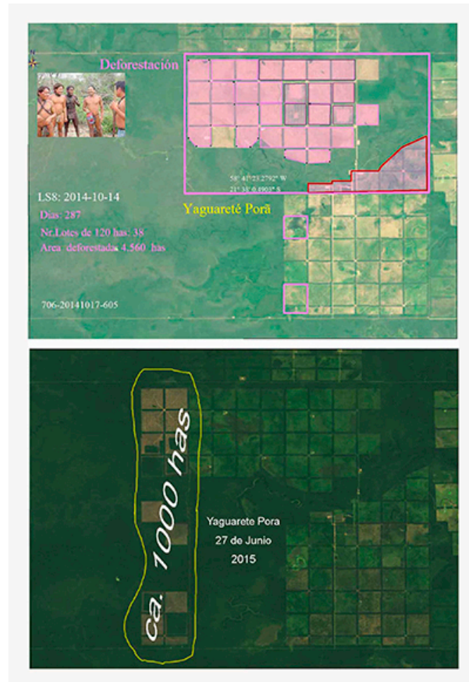
Last satellite images from illegal deforestation carried out by Yaguareté Porã in ancestral land of the Ayoreo. Dated June 27, 2015.