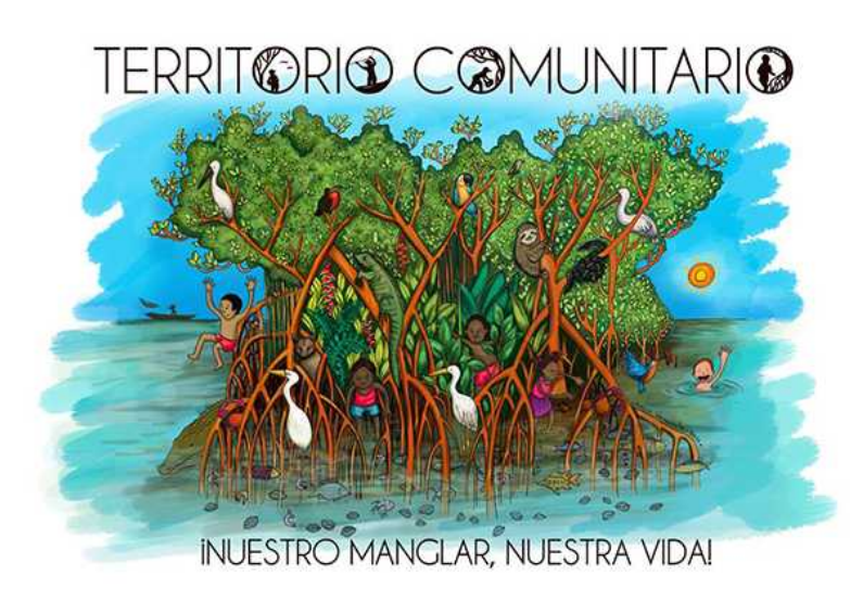
Community Territory. Our Mangrove, Our life! Ref: C-Condem

Shrimp grown in captivity is considered to be a strategic product in the government of Ecuador's national productivity plan. This industry was an illegal activity until 2008, when the government began a regularization process and basically handed over thousands of hectares of mangroves to shrimp entrepreneurs. This boost made it possible for industrial shrimp to be Ecuador's second largest export in 2019, after oil.