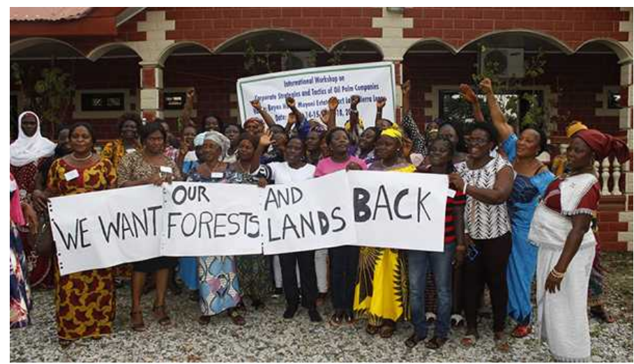
Women met in Port Loko. Sierra Leone. 2017

Most of the world's land is still stewarded by communities under customary systems. Whether it is legally recognized public land or customary land, billions of people rely on communally managed forests or savannas, farmland or pastures, for their livelihoods. This collective organization of life is viewed by capitalists as an obstacle to individual wealth creation and the accumulation of profit.