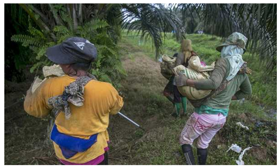
Female workers carry heavy loads of fertilizer at a palm oil plantation in Sumatra, Indonesia.

The extent of exploitation and discrimination of women within the palm oil industry has become difficult to deny. Companies as well as its certification scheme, the Roundtable for Sustainable Palm Oil (RSPO), have responded with the inclusion of gender-specific policies and guidelines in their operations. But, if the plantation model in itself is understood as a violent, destructive, structurally racist and patriarchal one, can these gender-specific policies do more than cover up this violence and destruction? How, in such context, do these gender policies unfold?