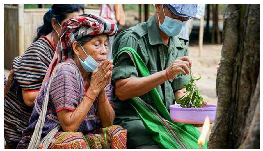
Karen community carries out a traditional ceremony to protect their forest on December 16, 2020.

In January 2021, Indigenous Karen People from Bang Kloi returned to their ancestral home deep in the Kaeng Krachan forests in Thailand after years of dispossession and near-starvation. The creation of the Kaeng Krachan National Park in 1981 meant the beginning of the dispossession of the Karen people of Bang Kloi. Since then, they have fought for their rights to live in their original territories. On top of the unbearable situation they confront in area where they were relocated, the Covid-19 pandemic made it clearer that returning home was the only answer for their survival.