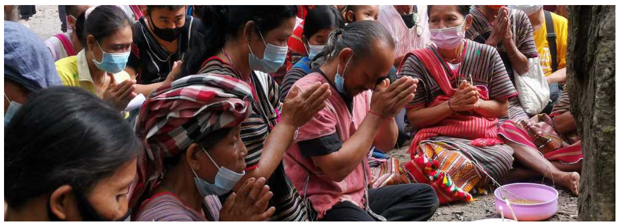
Members of the Karen communities holding a traditional ceremonyon 16 December 2020.