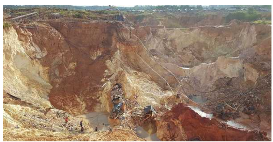
Gold mine known as "Eight dead" in Las Claritas. 2016: Clavel Rangel. Ph: Human Rights Watch