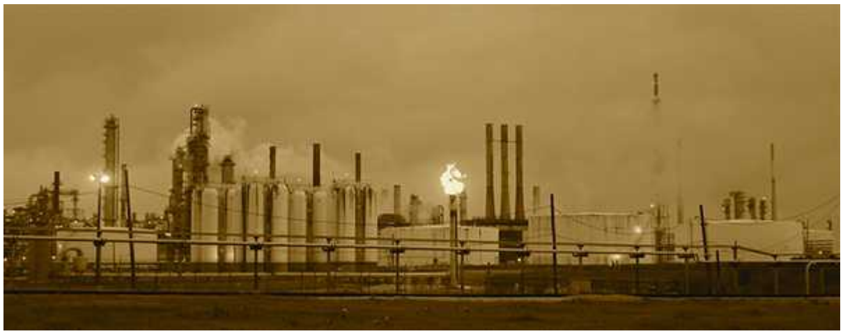
Shell Deer Park Refinery, Deer Park TX.

Offsets: Feeding the Illusion of a (Sustainable) (Green) (Carbon Neutral) (Nature-Based) (Net-zero emissions) Capitalism