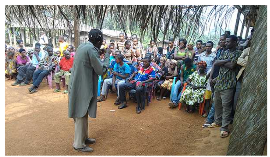
Mundemba, Cameroon, 2016.

For many decades, communities in West and Central Africa have been facing industrial oil palm plantations encroaching onto their community land. With the false promise of bringing 'development' and jobs, corporations, backed up by the support of the governments, have been granted millions of hectares of land under concessions for industrial oil palm plantations.