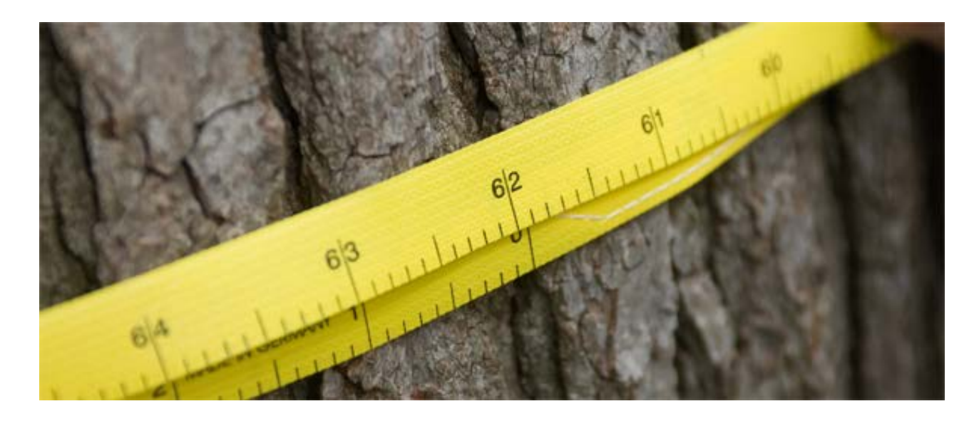
REDD+ myth: Sustainable Forest Management

Myth: Sustainable Forest Management will reduce forest emissions and bring sustainable development.