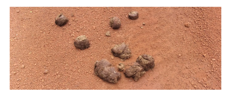
Elephant dung not far from the village of Lambarene-Kili

A villager from Bougounga described the situation: "We do not have enough space left so we plant near our homes due to the problems with the elephants, as they ravage everything we try to do in the forests that are left. That's why we decided to plant close to our homes, but over time we have become victims of these elephants that come right behind our homes to feed, and we fear for our safety and that of our children."