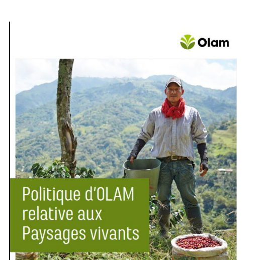
Olam Living Landscapes

The word "net", although it might appear insignificant, is in fact crucial. "Zero net deforestation" means that the total area of forest within a given geography remains unchanged. However, this can be achieved not only by not destroying any more forest but also by planting new trees to offset forest that has been destroyed. (15) "Zero net deforestation" thus allows a company to continue destroying forests as long as it restores "comparable" areas elsewhere by planting trees. In practice, this means that a company "compensates" for forest destruction by protecting other "comparable" areas in terms of biodiversity and types of flora, which they claim would be at risk of destruction.