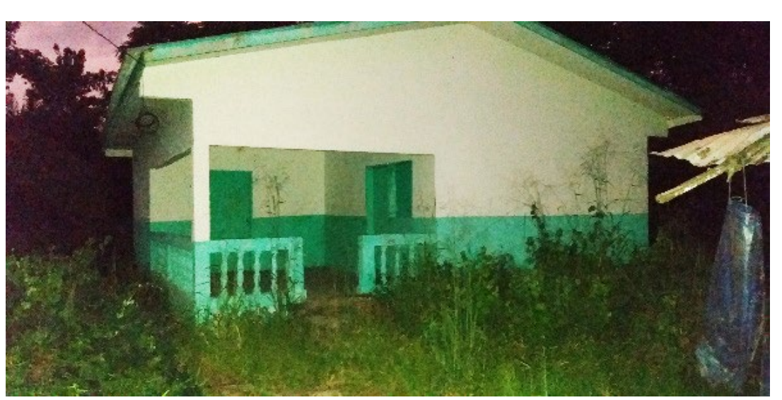
The closed dispensary at Rembo village.

A related problem is mentioned by villagers in Fanguidaka, Lambarene-Kili and Rembo. The steering committees (comités de pilotagem), led by the mayor and set up with representatives of each community in each concession lot to oversee the implementation by OLAM of the social contracts, barely function. Villagers complain these committees have not held any meetings for a long time.