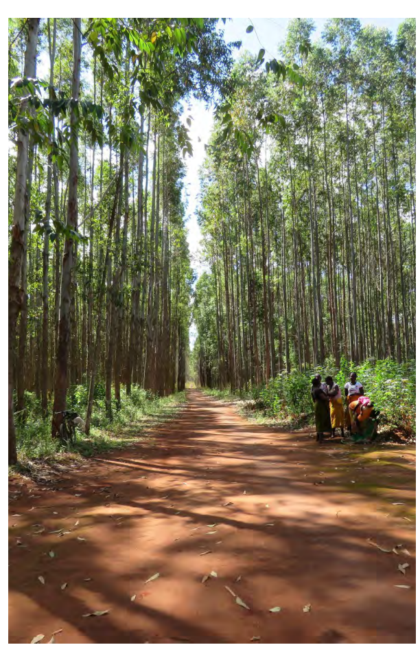
Monoculture tree plantation in Mozambique

of their role in collective processes of organisation, struggle and resistance against the threats to their territories; in the production and strengthening of knowledge and culture; in family and community life, and in the transformation towards power structures that ensure meaningful involvement by all community members.