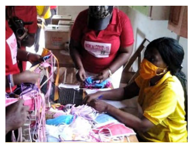
Solidarity in action during the Covid19 pandemic.