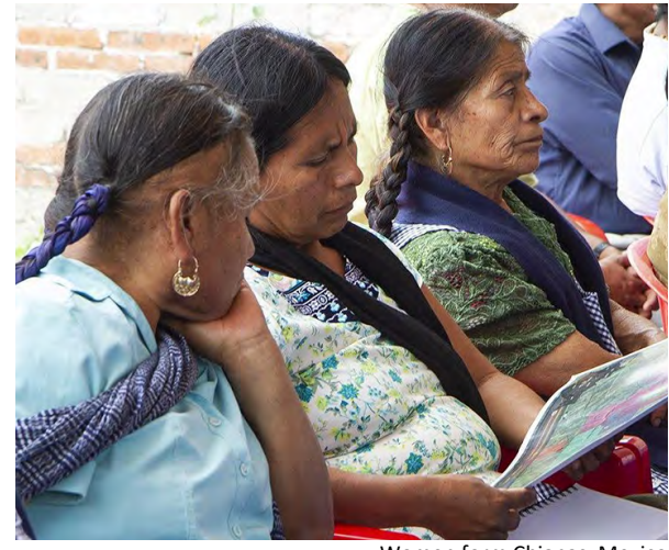
Women form Chiapas, Mexico

For this reason, WRM's actions are oriented to support the struggles of indigenous peoples and peasant communities in defence of their territories.